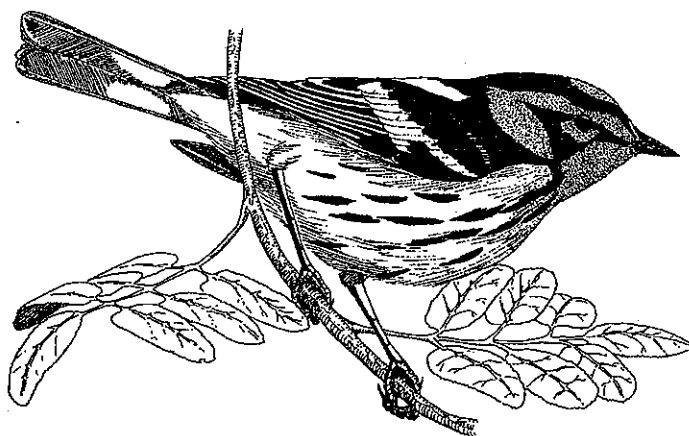
This Black-and-white Warbler may be seen on one of the TCAS field trips.

"Our thanks to everyone who participated," Dory said. "These small events brought us $600 we didn't have before."